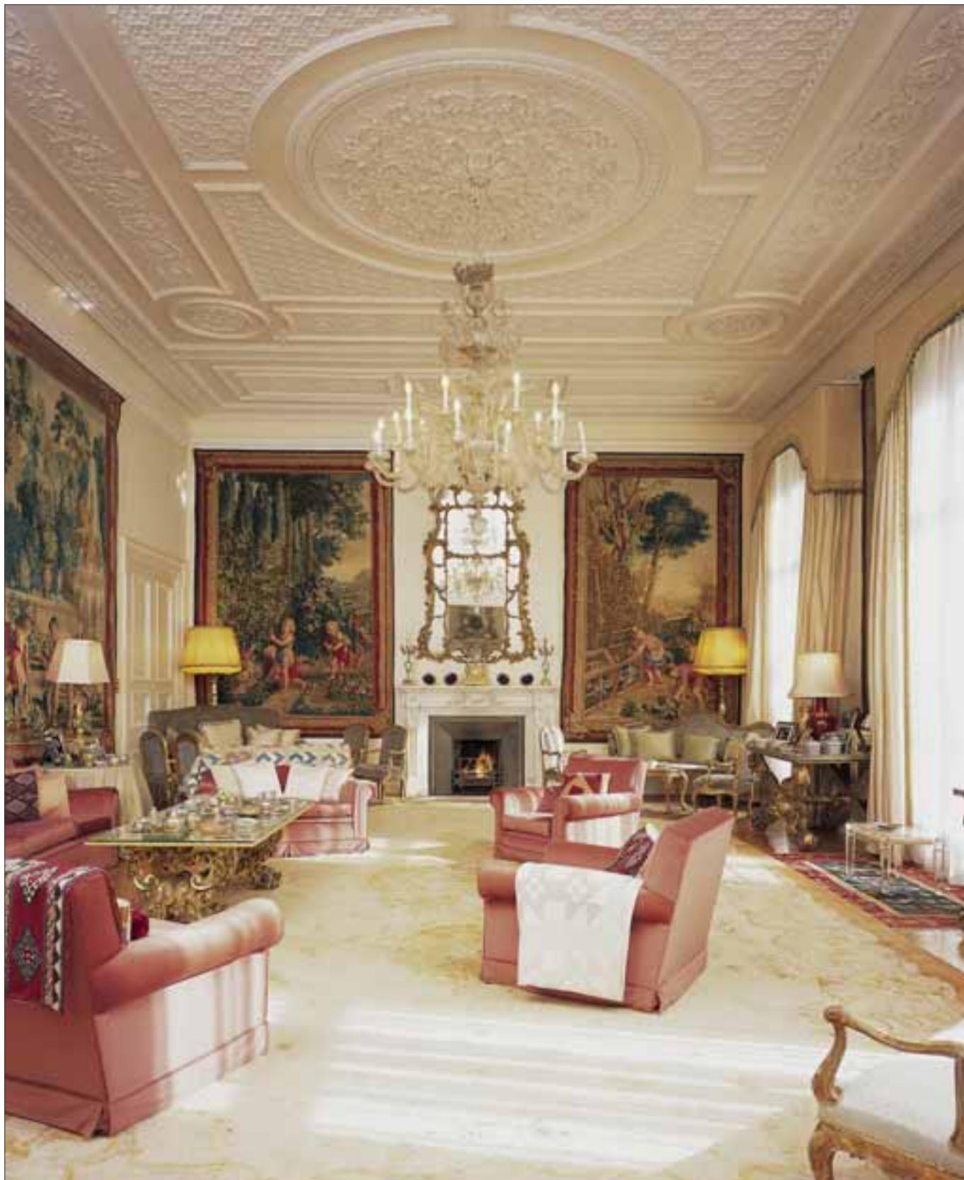
39. The Adam Room.