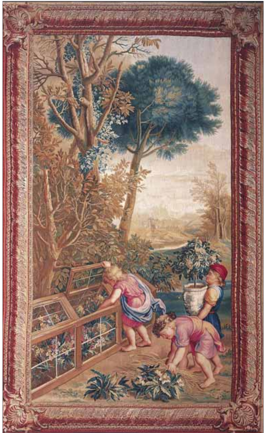
44. Autumn , one of the tapestries Les Enfants Jardiniers in the Adam Room.