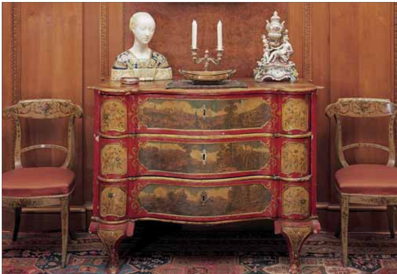
63. A commode from the Veneto in the Venetian Drawing Room.