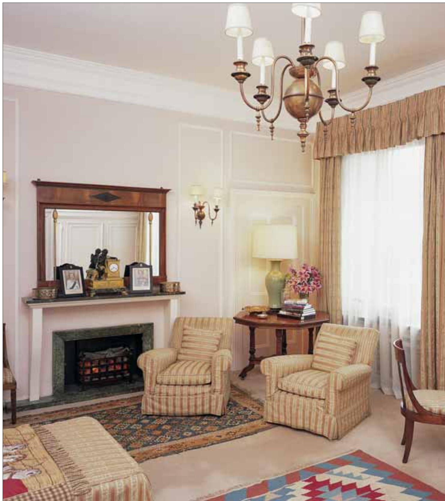
67. One of the private apartments.