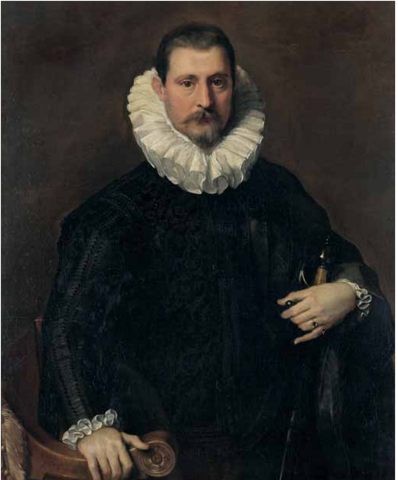
49. Federico Barocci, Portrait of Count Federico Bonaventura , Blue Room.