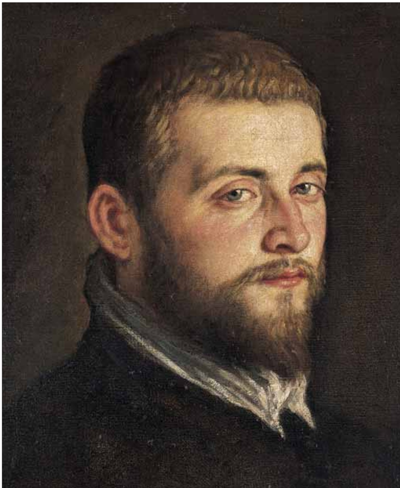
61. Leandro Bassano, Portrait of a Young Man , Venetian Drawing Room.