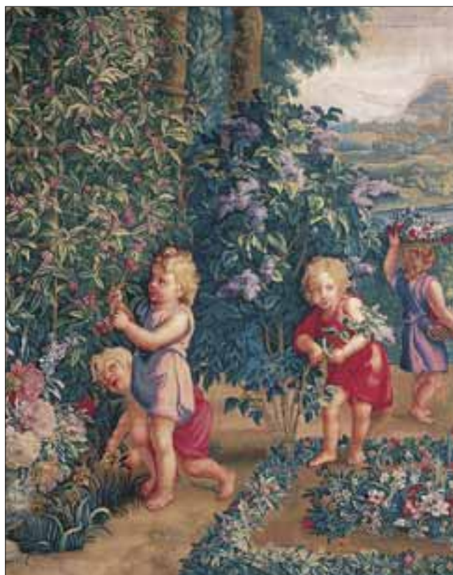
43. Detail of one of the series Les Enfants Jardiniers in the Adam Room.