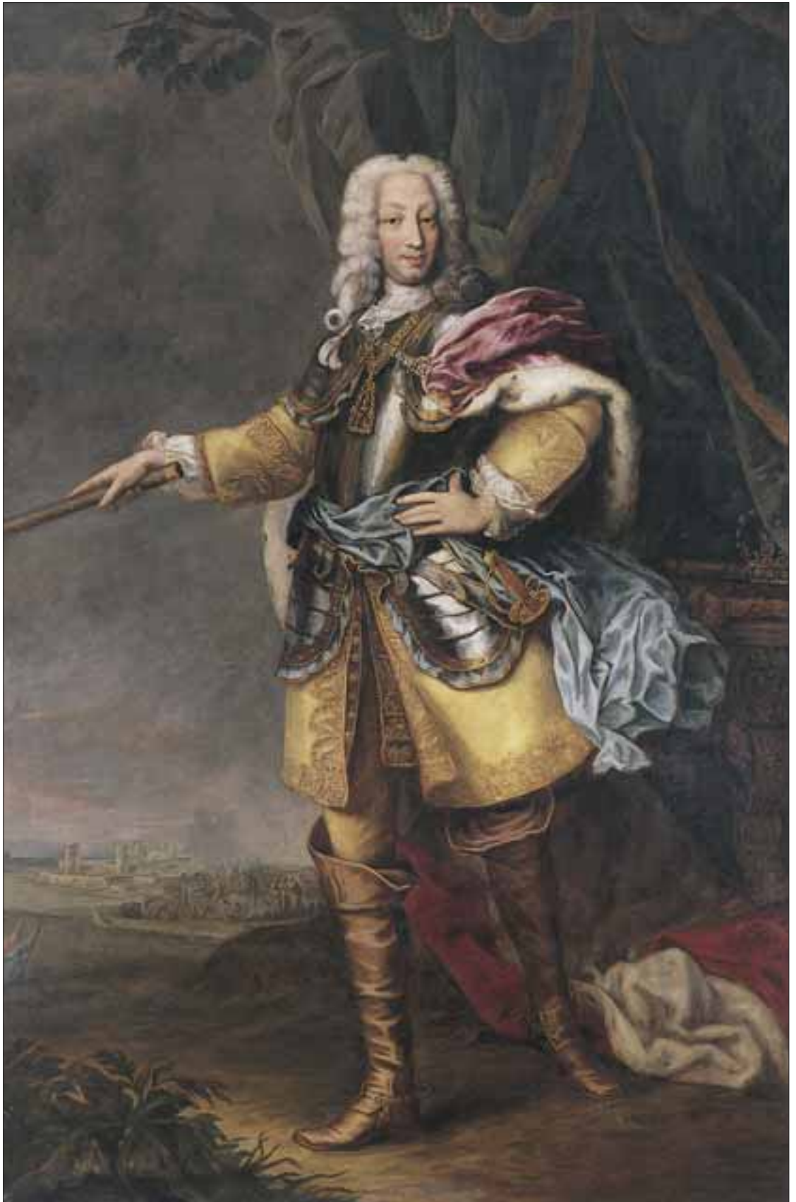
59. Maria Giovanna Clementi, called la Clementina, King Carlo Emanuele III.