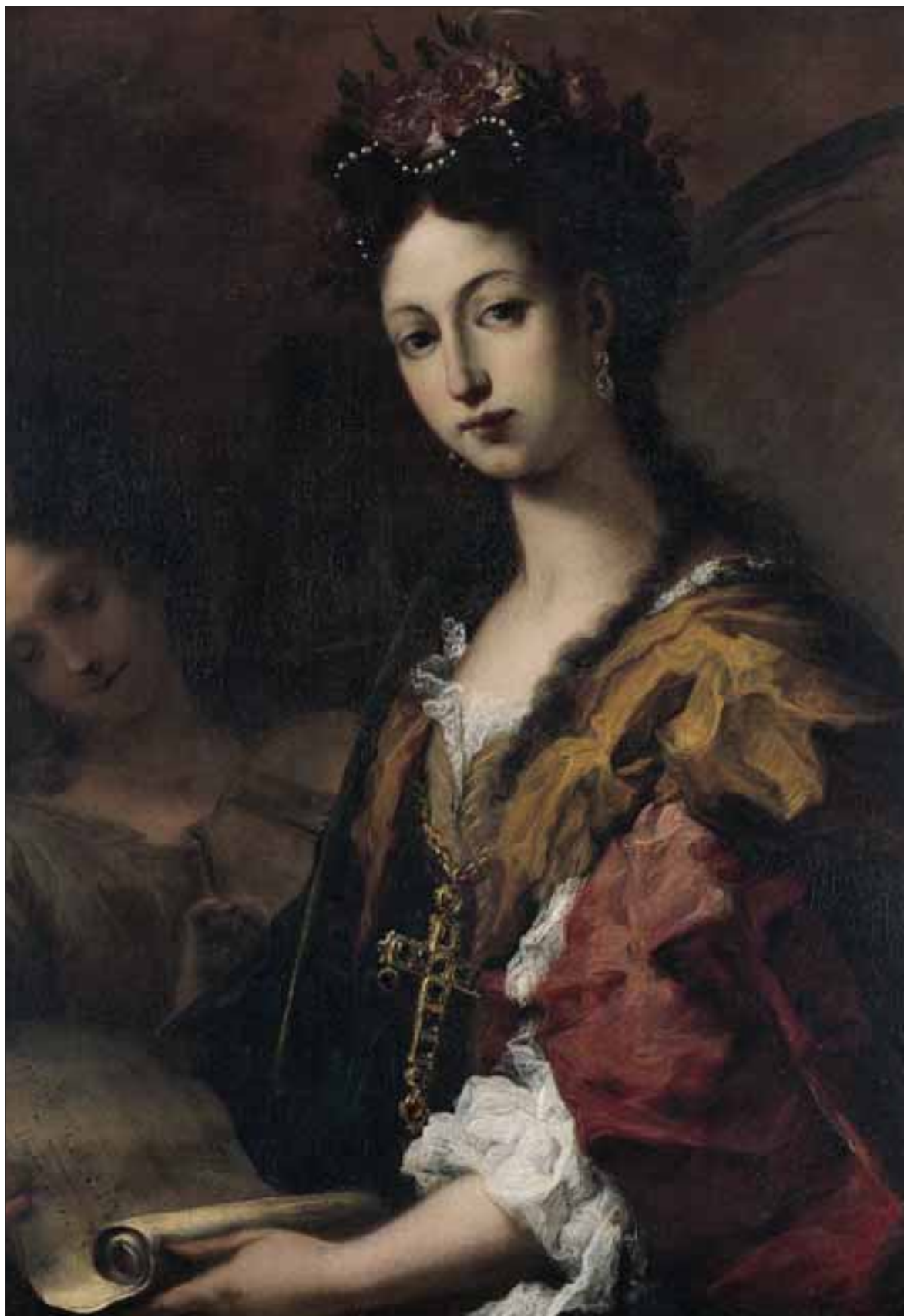
68. Francesco Cairo, St. Cecilia , private apartments.