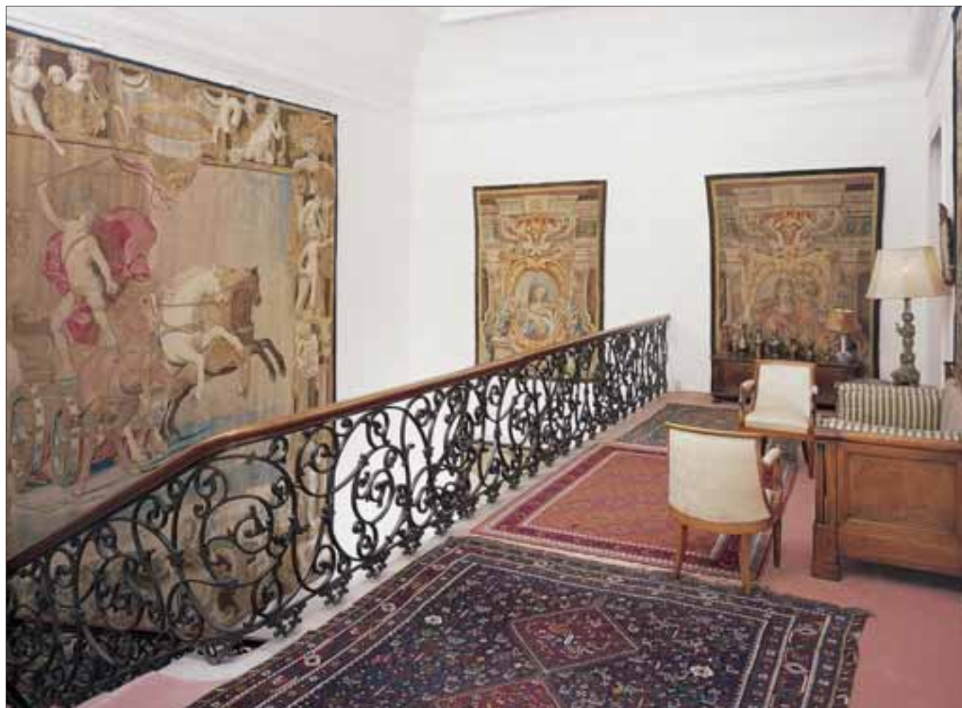
37. The second floor landing.