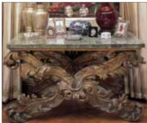
40. An Emilian giltwood table, Adam Room.

On the landing of the first floor, one can walk past a very nice Roman giltwood console of the eighteenth century and enter the Adam room, so called because the plasterwork of the ceiling imitates the style of the two famous architects. (fig. 39)