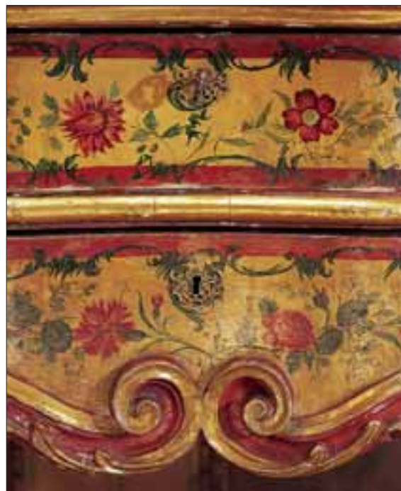
65. Detail of fig. no. 66.