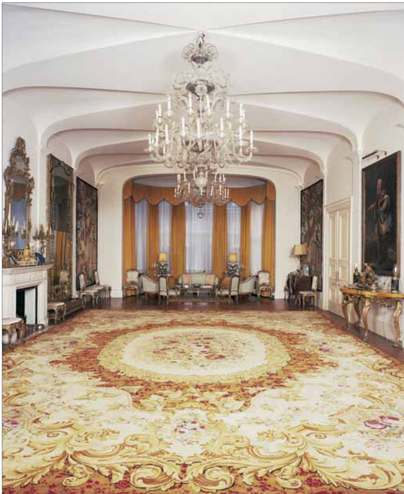
56. The Ballroom.