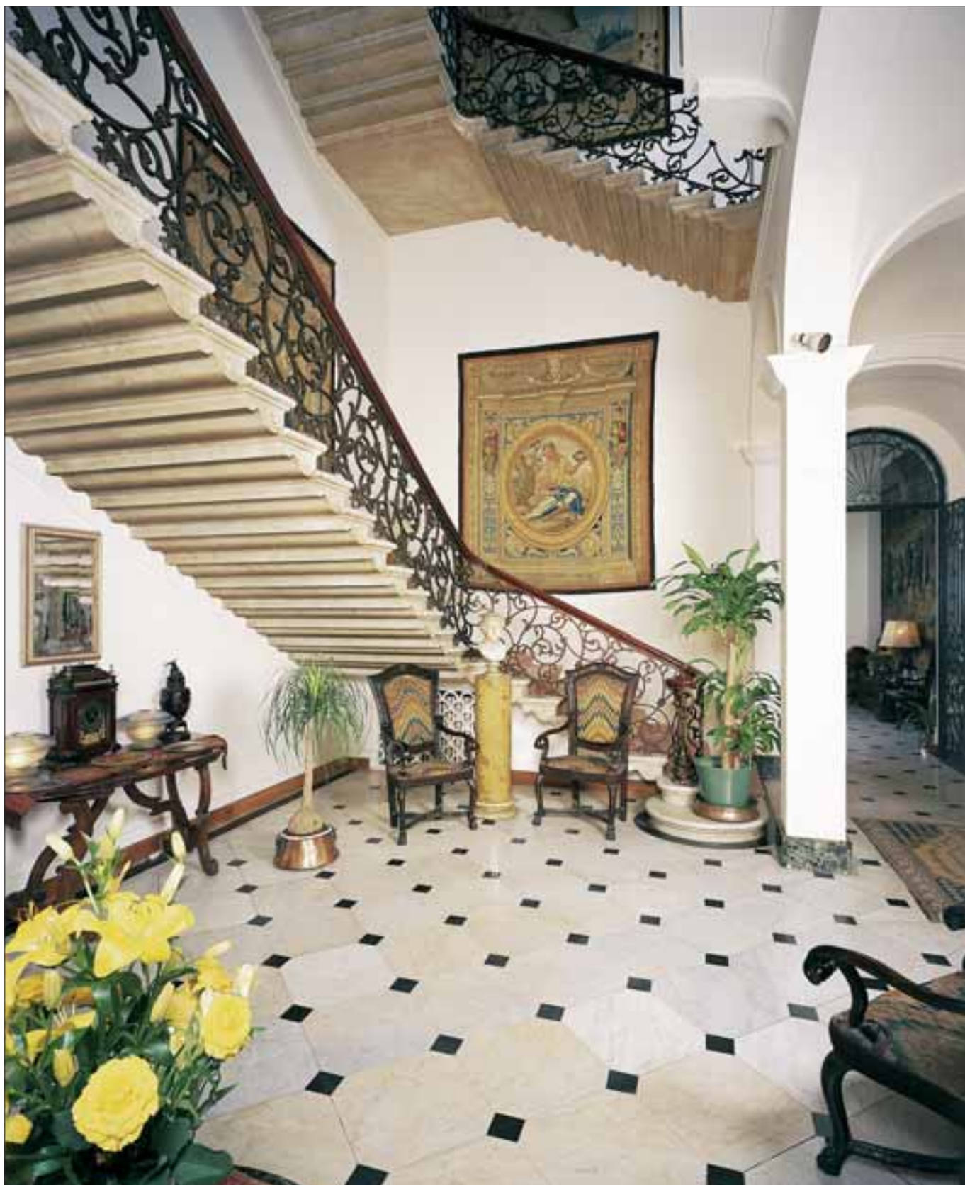
30. The staircase.