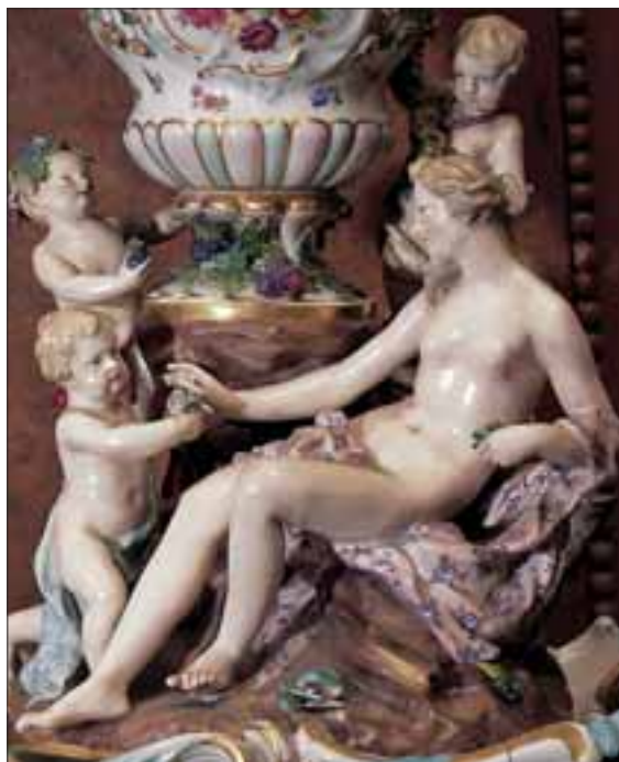
64. Detail of a Meissen group in the Venetian Drawing Room.