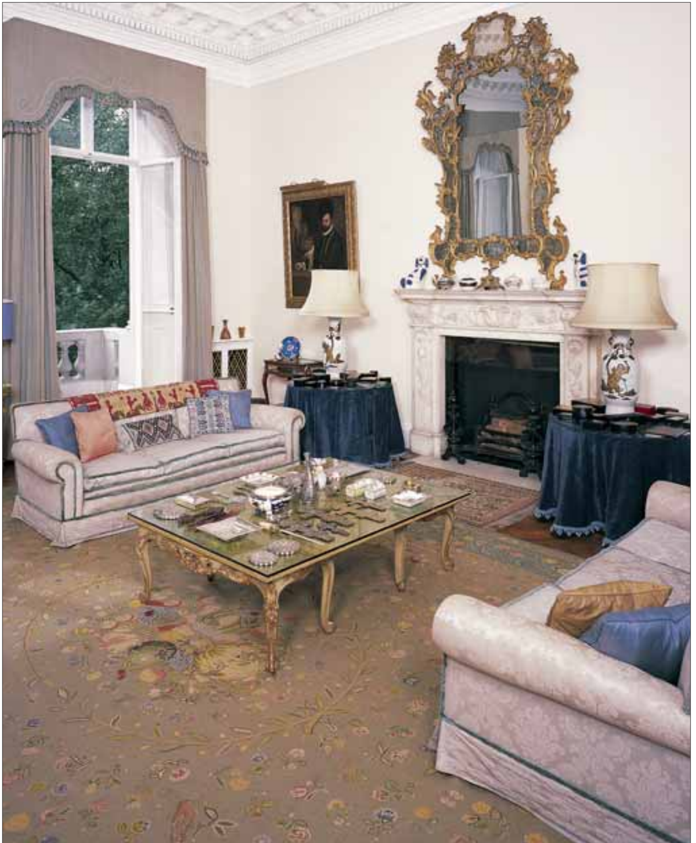
45. The Blue Room.