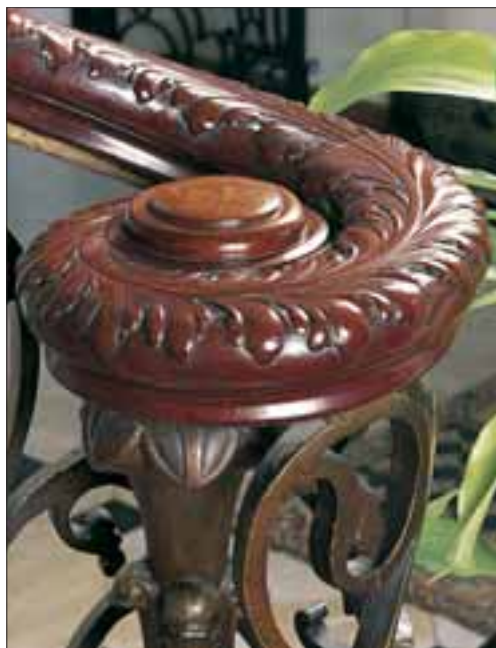
31. Detail the staircase.

The grand staircase is the heart of the house. It creates a beautiful opening to the upper floors and it gives an impression of importance and a strong identity to the building. (figg. 30-31)