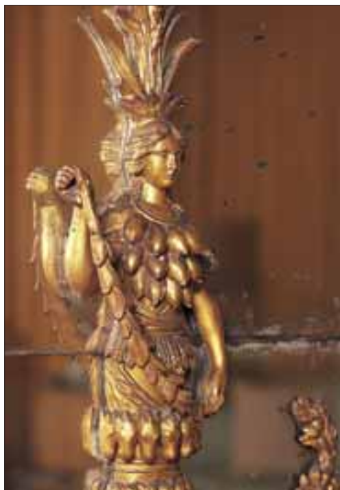
57. Detail of one of the Venetian mirrors in the Ballroom.

From the Blue Room one enters the Ballroom, a large and magnificent space where beautiful tapestries and furniture can be seen. ( fig. 56 )