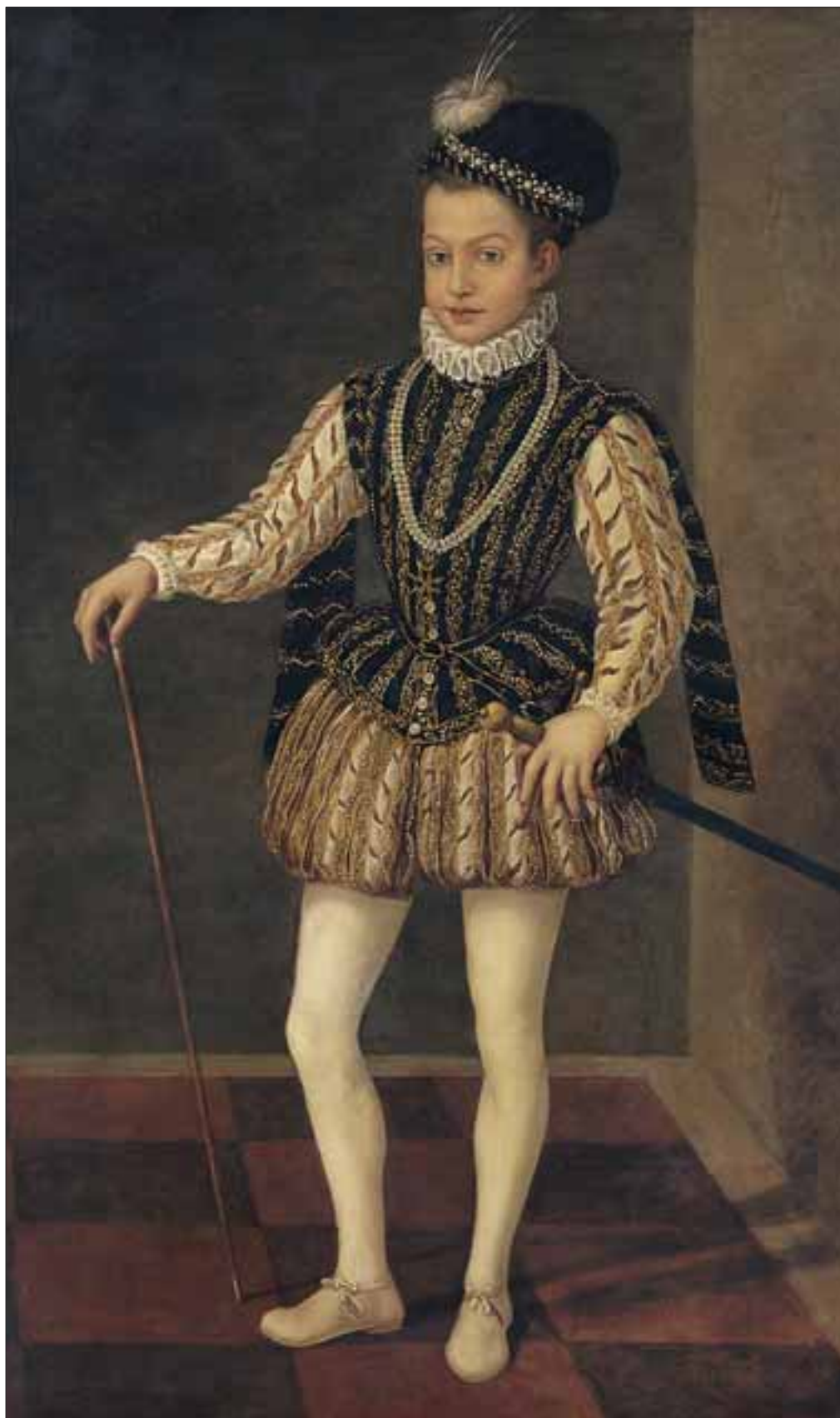
46. Giacomo Vighi, called L'Argenta, Duke Carlo Emanuele of Savoy , Blue Room.