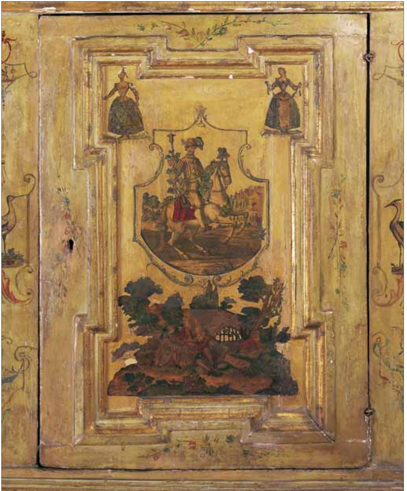
55. Detail of a commode in the Blue Room.