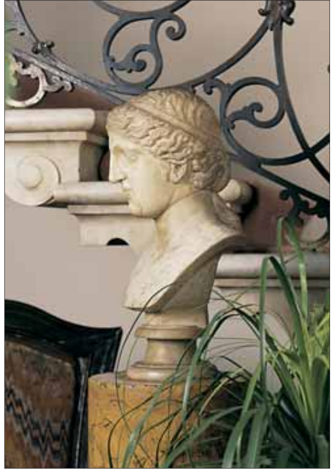
32. A late 17th century bust after the antique in the staircase. 33. An antique bust (with restorations) in the staircase.

burning lamp), and a figure of Faith hanging on the wall of the stair at the second floor. (fig. 37)