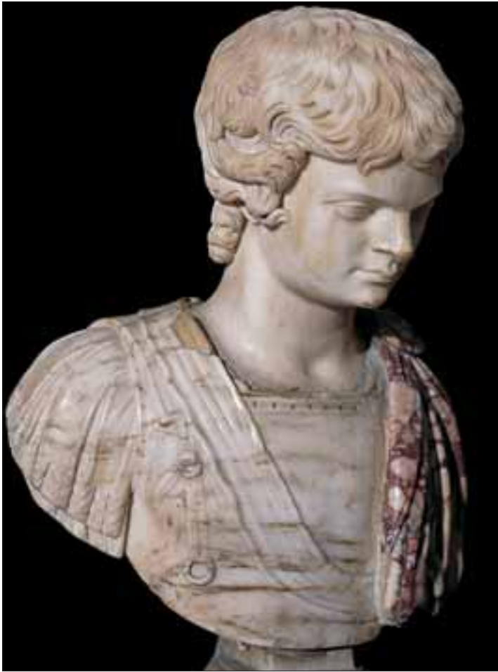
34. A bust after the antique in the staircase.