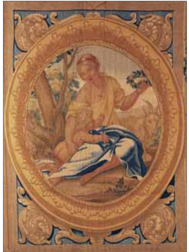
35. A Florentine 17th century tapestry in the staircase.