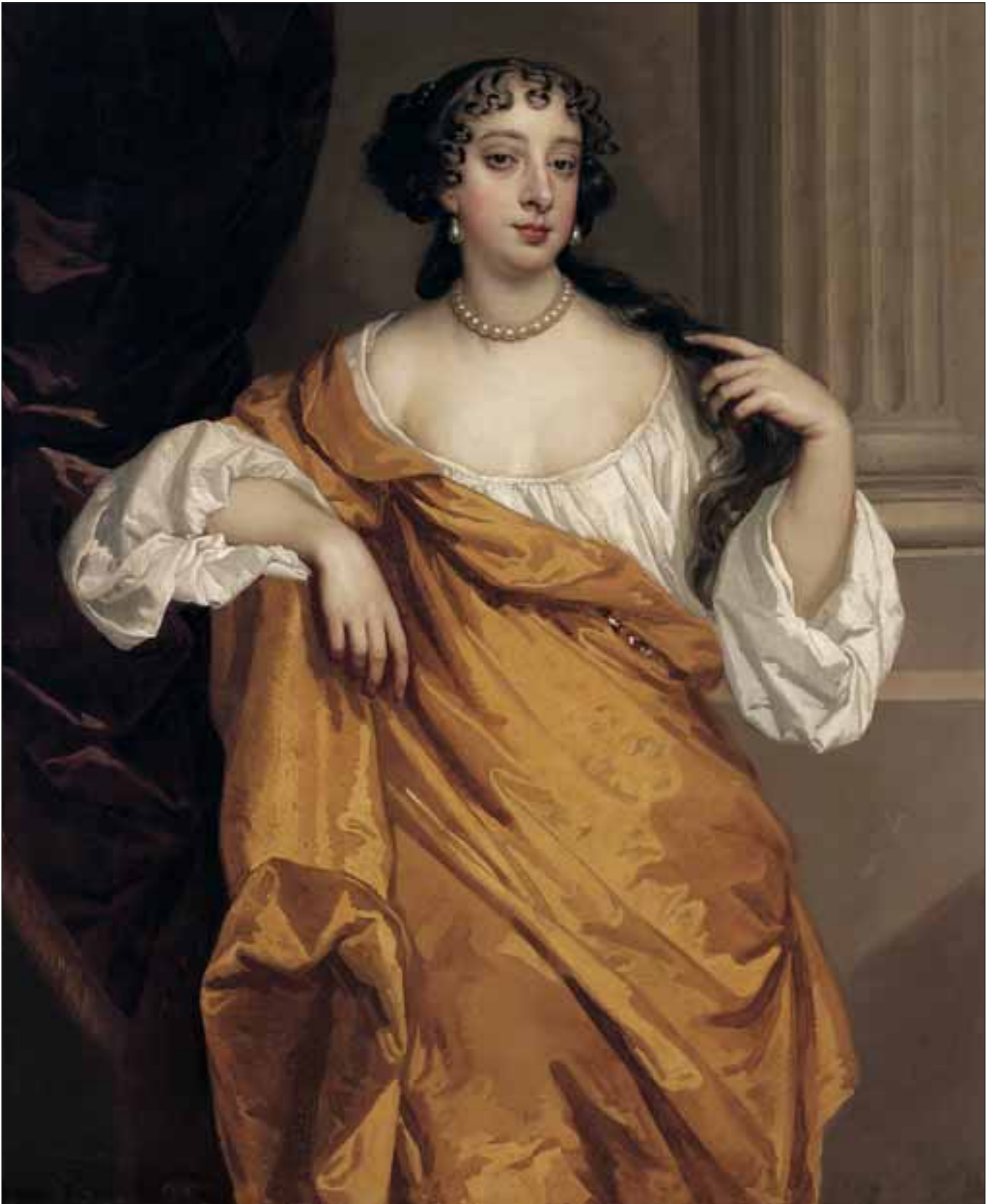
50. Sir Peter Lely, Barbara Villiers, Countess of Castlemaine , Blue Room.