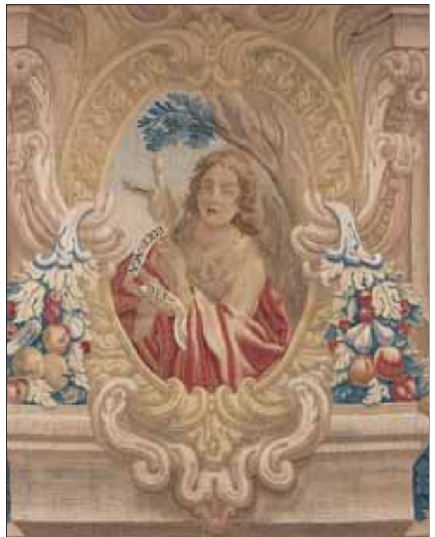
36. St. John the Baptist, Florentine 17th century tapestry, first floor landing.