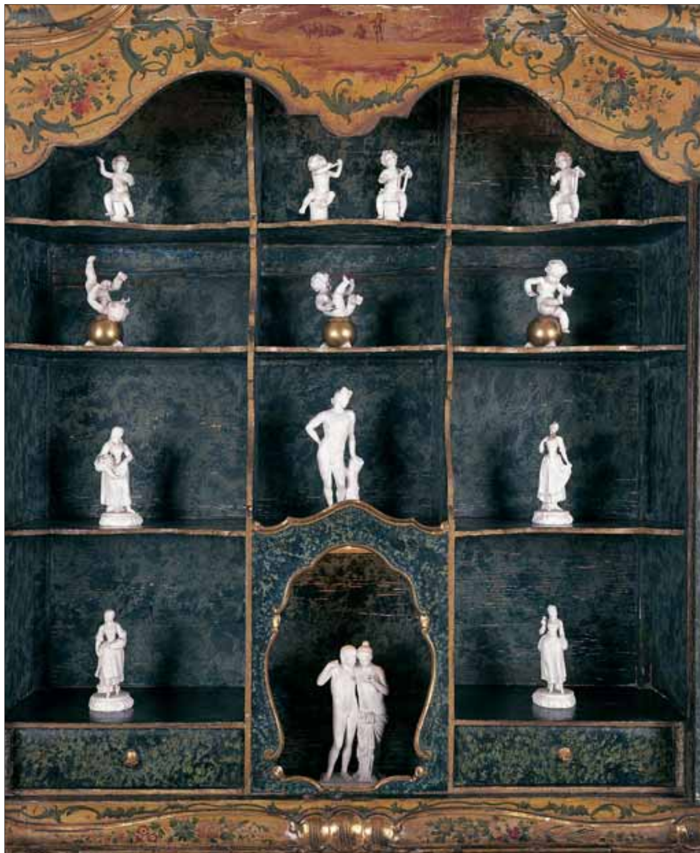
54. Porcelain and biscuit statuettes in the Venetian bureau-trumeau in the Blue Room.