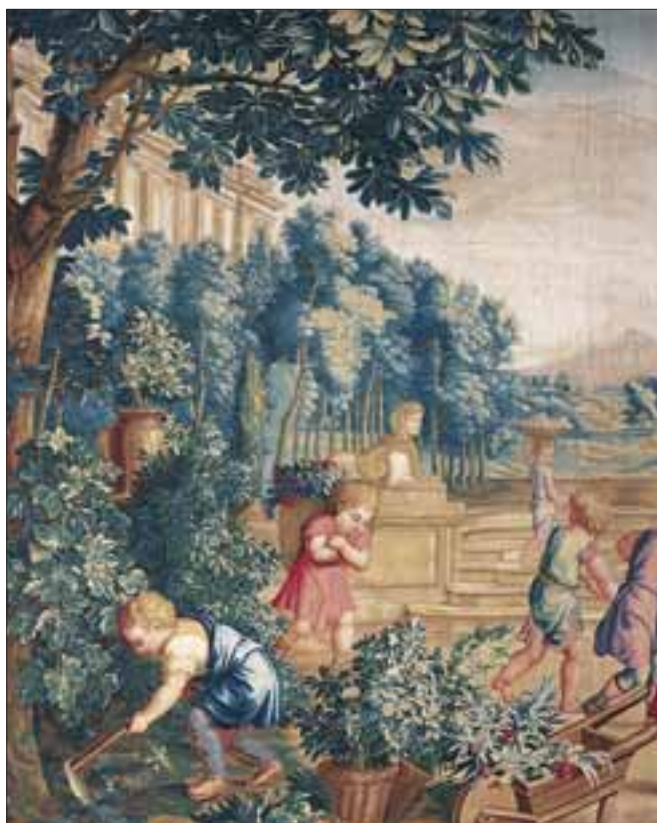
42. Detail of fig. no 41.