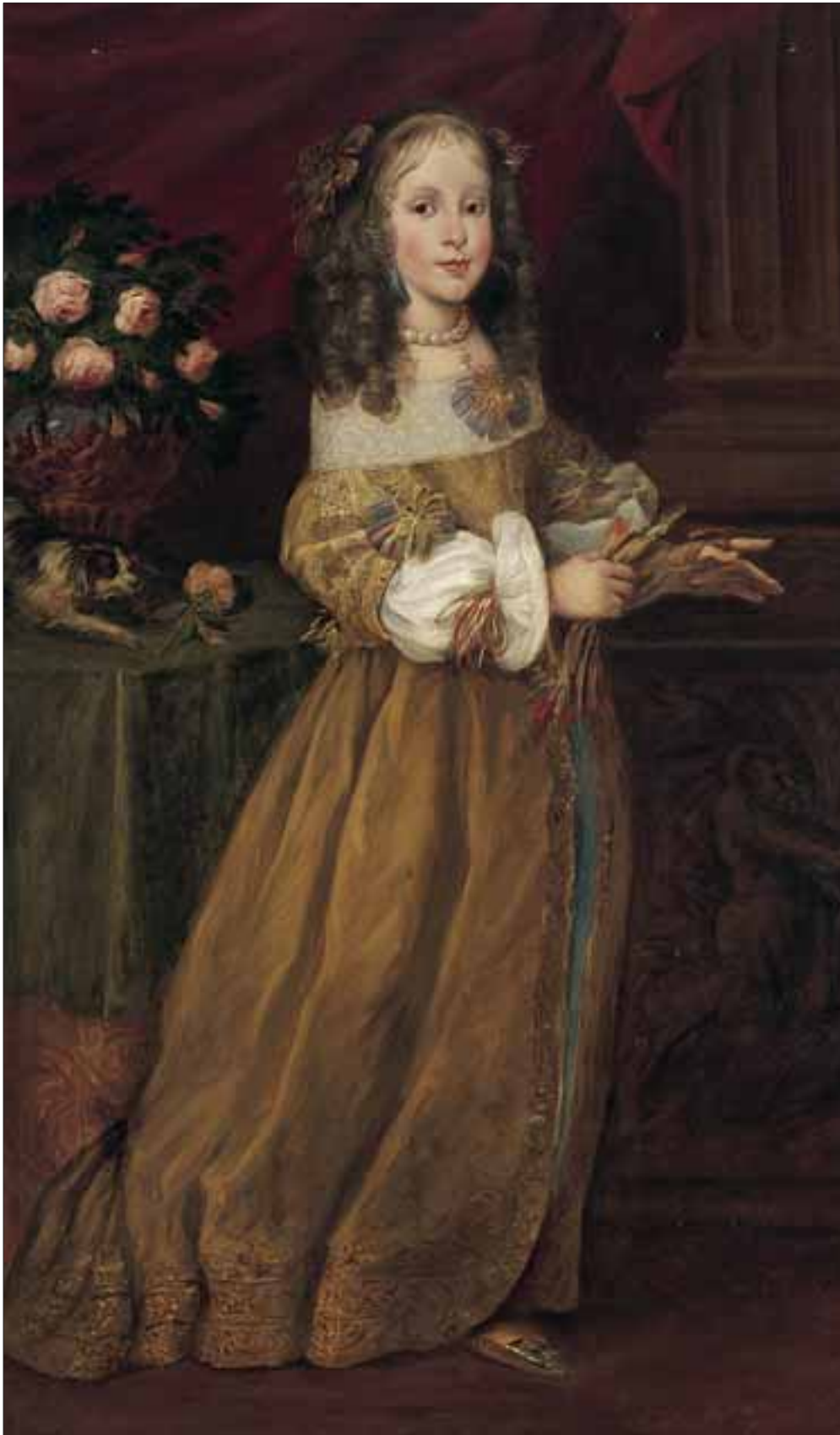
47. 17th century Piedmontese painter, Isabella of Savoy (?), Blue Room.