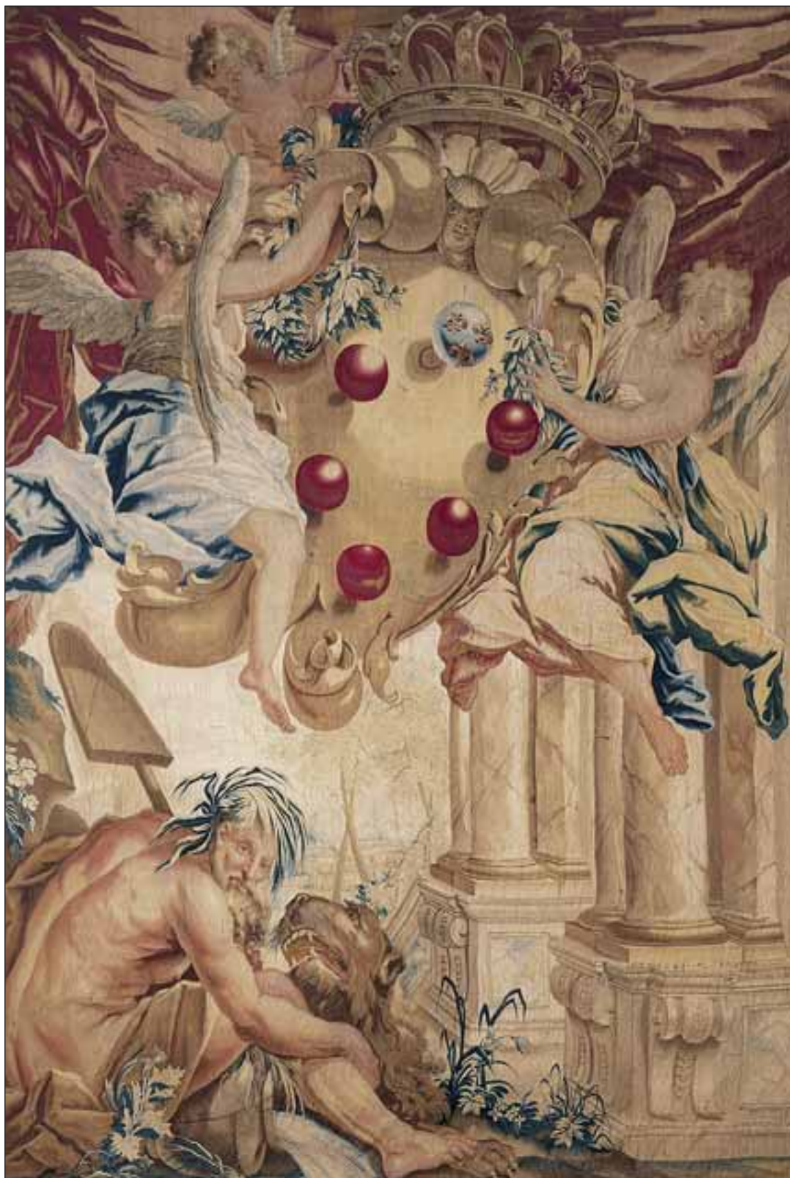
58. One of the four tapestries with the River Arno and the Medici coat-of-arms in the Ballroom.