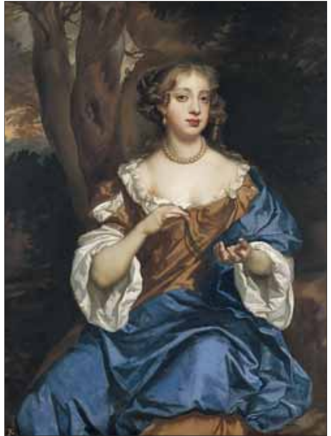
53. Sir Peter Lely, Portrait of an unknown Lady , Venetian Drawing Room.