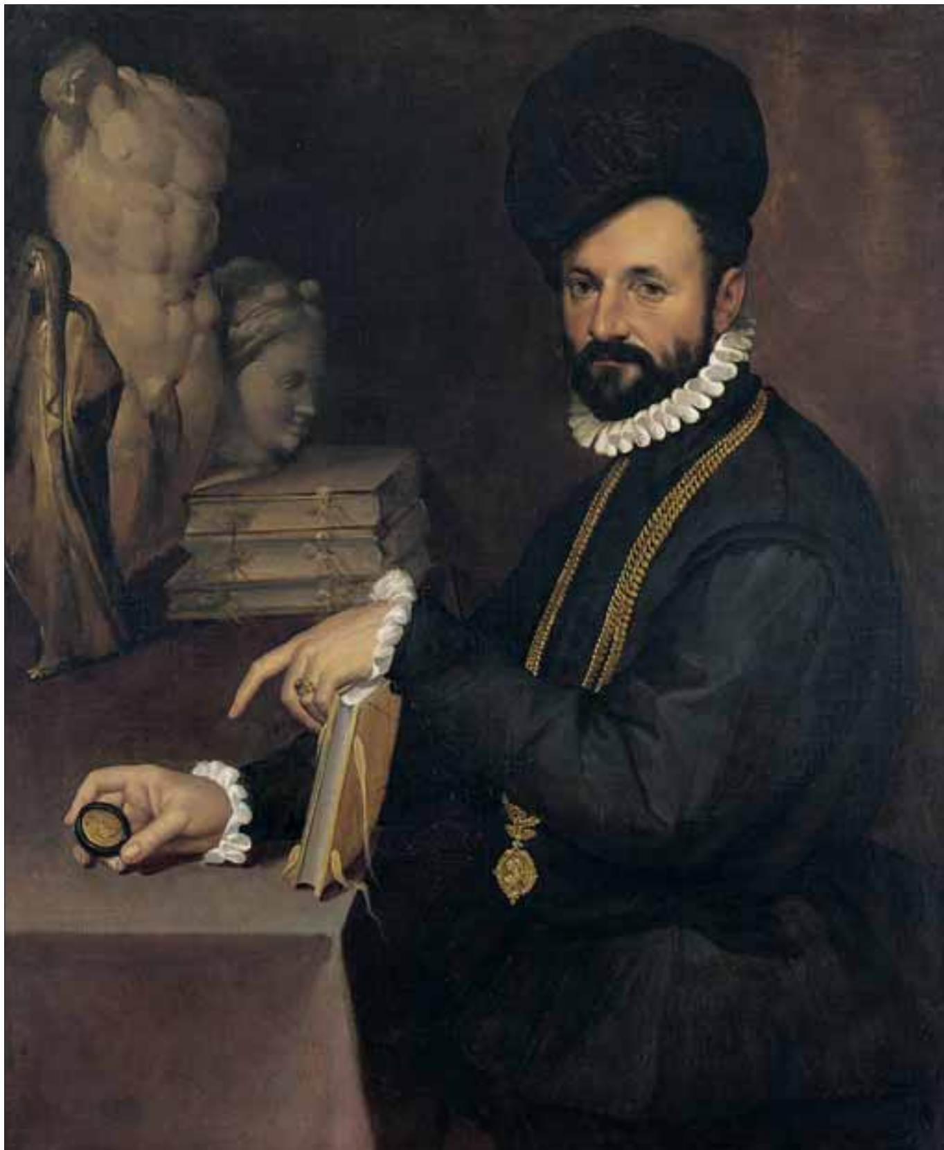
48. Bartolomeo Passarotti, Portrait of a Collector (the sculptor Domenico Poggini?) , Blue Room.