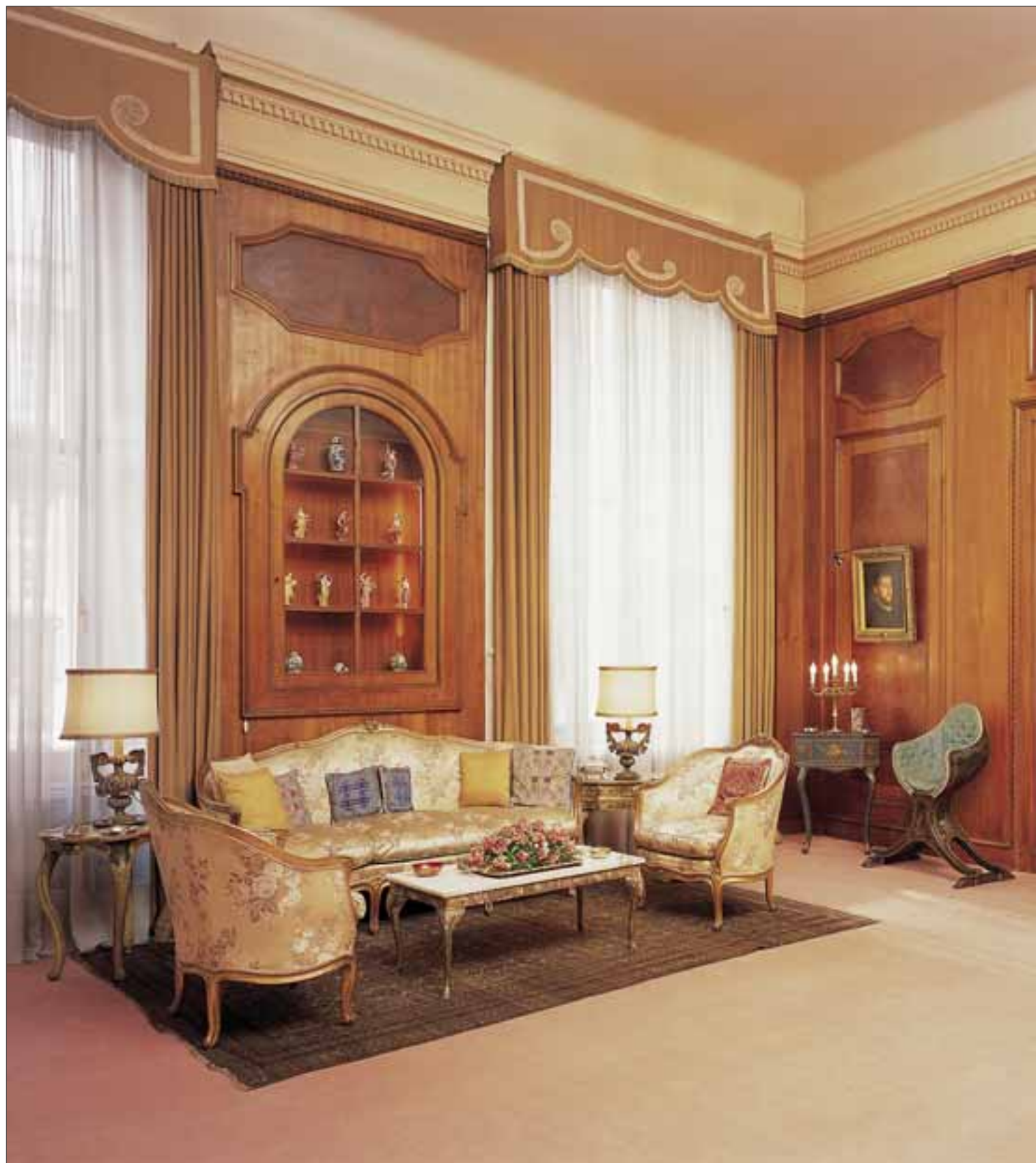
60. The Venetian Drawing Room.