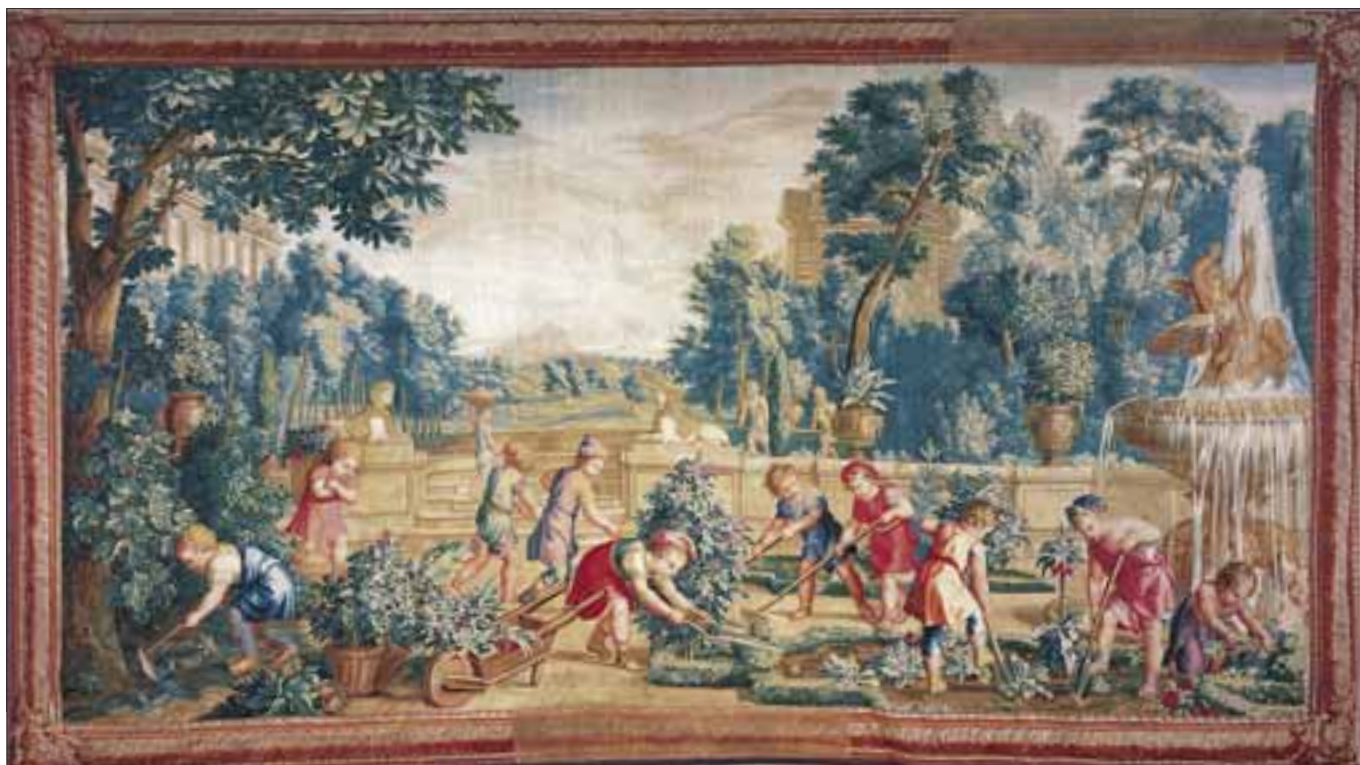
41. A tapestry of the series Les Enfants Jardiniers in the Adam Room.