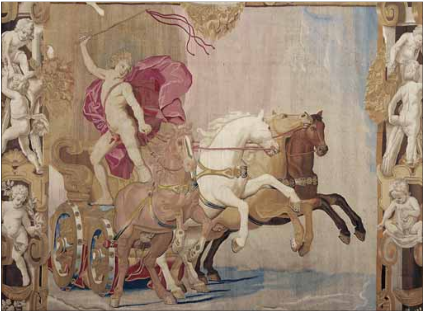
38. Pierre Lefèvre, The Chariot of the Sun , staircase.