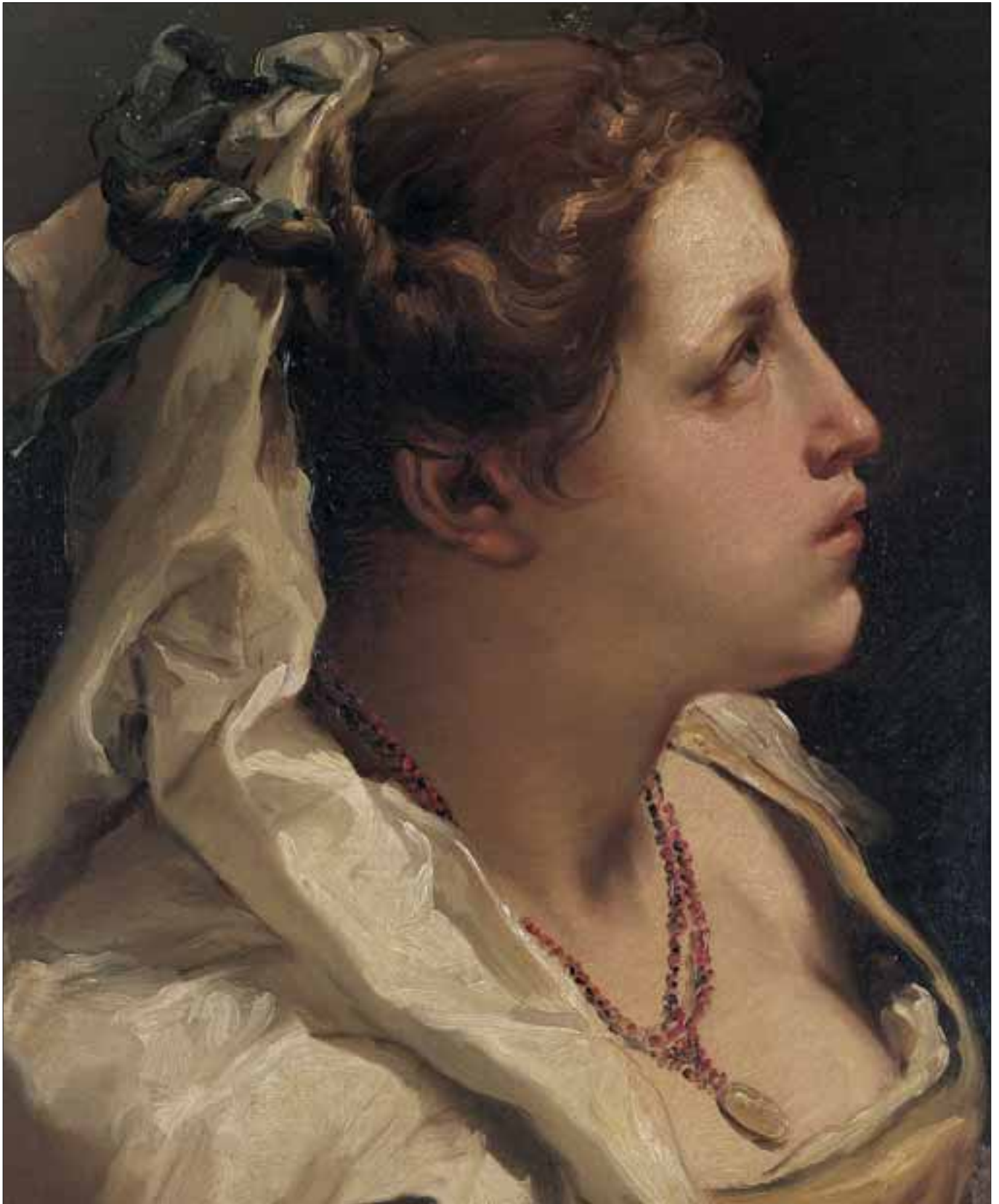
62. Gaetano Gandolfi, Head of a Popolana , Venetian Drawing Room.